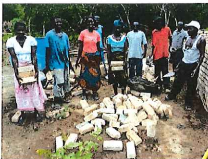
Our building team at the start of the project

RIPPLE Africa is building a Girls Dormitory at Kapanda Secondary School in Malawi. This is a government school built and supported by RIPPLE Africa. The dormitory will provide accommodation for 56 girls from years 2 and 4 and a matron, and will include safe sleeping quarters, dining/study area, kitchen, toilets and washing facilities. The dormitory will provide a safe, supportive and empowering learning environment for study and revision.