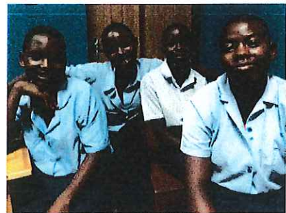
Some of the students who will be living in the dormitory during term time

Whiteleaf Business Centre · 11 Little Balmer · Buckingham · MK18 1TF · England Tel: +44 (0)1280 822891